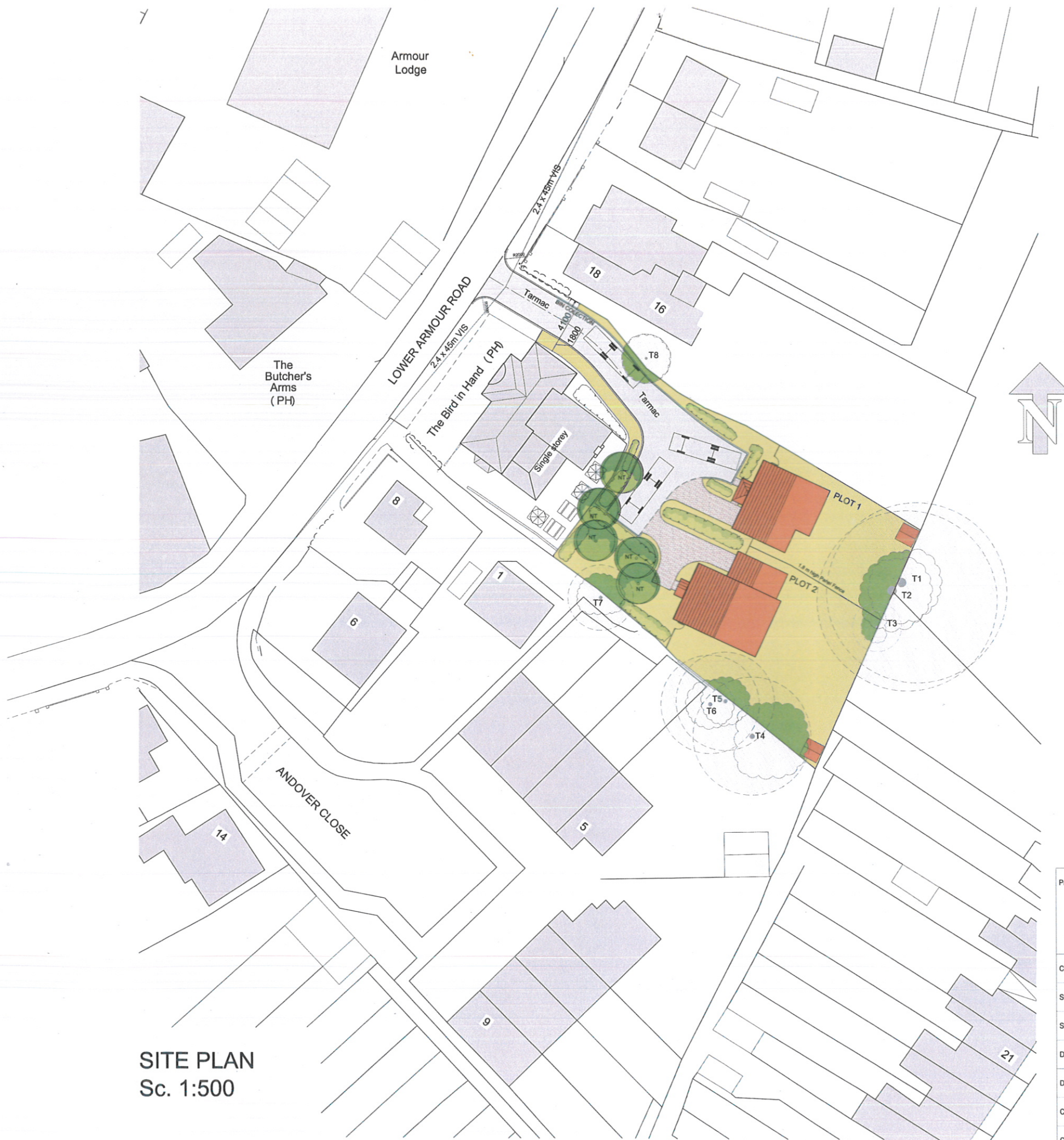
SITE PLAN Sc. 1:500